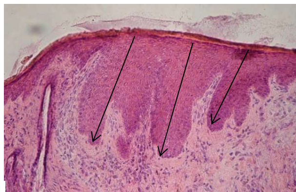
Figure 2b. Ki67 index. The Ki67 index is the number of Ki67 positive cells / mm basal membrane.

Figure 2a. Epidermal ridge thickness. H&E stained section of a transplant injected with activated cells. The average epidermal ridge thickness is calculated from measurements of epidermal ridge thickness (see black arrows) made at regular intervals over the length of the human epidermis.